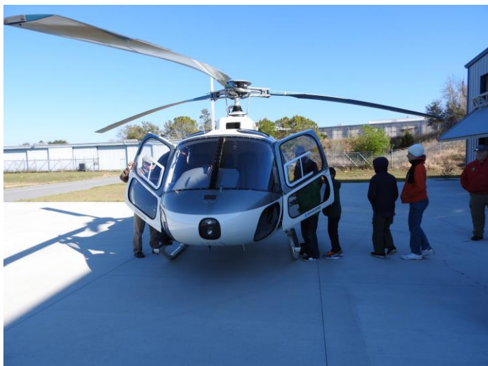
Scouts get ready to board the 5 passenger helicopter for a Young Eagles Flight.