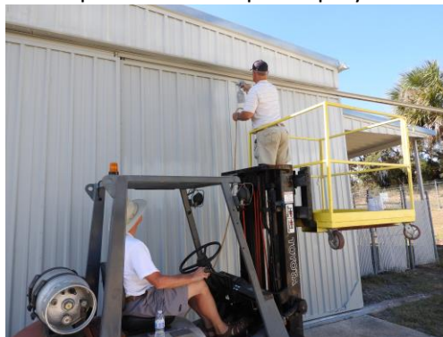
Brainerd Helicopter, maker of the Firehawk Helicopter, loaned EAA Chapter 534 their fork lift with a gated platform that could be moved up and down making the painting project easier and safer.