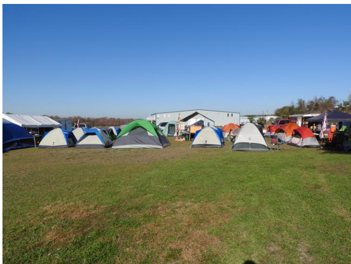
Scouts spent two nights camped out at the Leesburg International Airport in Leesburg ,FL